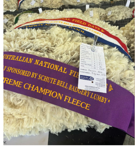
Orange Field Days 2025 Champion Medium Wool Ewe Fleece and The Supreme Fleece went to Boomey Park.