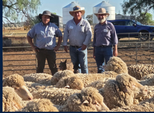
Winners of the Trundle Ewe Competition, followed by second place in the Central West Merino Flock Ewe Competition.