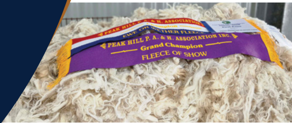
Dubbo Nationals, Peak Hill & Parkes Show 2025 Unbeaten Ewe fleece, exhibited by Towonga.